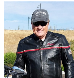
Gene Walker Photographer